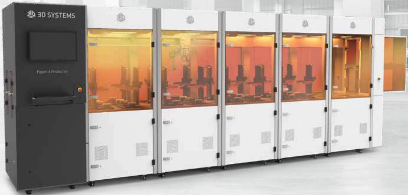
Figure 4 Production combines the design flexibility of additive manufacturing in configurable, in-line production cells to deliver a customizable and automated direct 3D production solution.

Industry's first customizable, fully-integrated factory solution for direct digital production