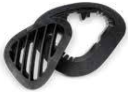
Figure 4 rigid materials produce durable plastic parts with the look and feel of cast urethane or injection molded parts, with features that include fast print speeds, high elongation, exceptional impact strength, humidity/moisture resistance, long-term environmental stability and more.