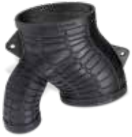
Figure 4 elastomeric materials are ideal for the production of functional rubber-like parts with excellent shape recovery, high tear strength, great for compressive applications and material malleability