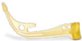
Figure 4 Production is compatible with 3D Systems' entire portfolio of NextDent® materials to facilitate full customization of dental devices. You can also choose from Figure 4 specialty materials for sacrificial tooling, jewelry casting, medical applications requiring biocompatibility and/or sterilization, and more.

See material selector guide and individual material datasheets for specifications on available materials.