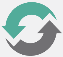
FIGURE 4 PRODUCTION RIVALS INJECTION MOLDED PART QUALITY WITH TOOL-LESS DIGITAL PRODUCTION TO DELIVER:

* Throughput improvement compared other 3D printing systems based on various use cases on Figure 4 Production; parts cost compared to traditionally manufactured parts and operations at a volume of 500 parts on Figure 4 Production