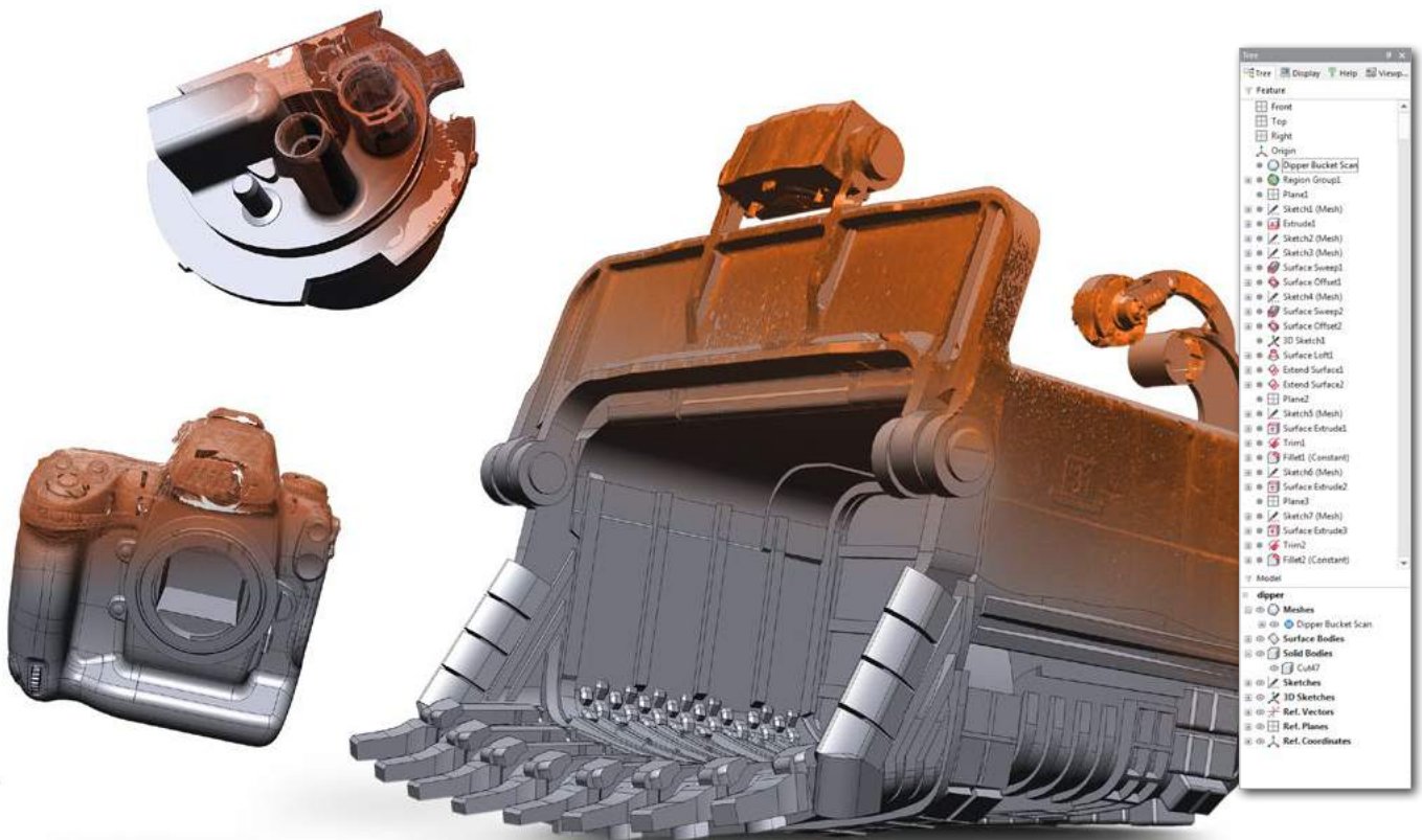
A parametric solid models created in Geomagic Design X

Save significant money and time when modeling as-built and as designed parts. Deform an existing CAD model to fit your 3D Scans. Reduce tool iteration costs by using actual part geometry to correct your CAD and elimination part springback problems. Reduce costly errors related to poor fit with other components.