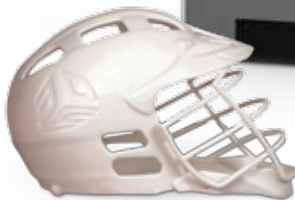
Helmet model printed in Accura Xtreme White 200