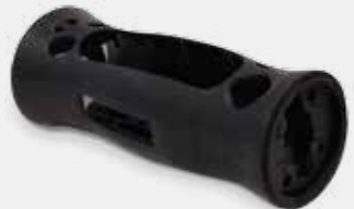
Toy prototype printed in Accura ABS Black

SLA printers are able to print highly detailed, tiny parts just a few mm in size, all the way up to 1.5 m long parts—all at the same exceptional resolution and accuracy. Even large parts remain highly accurate from end-to-end, with virtually no part shrinkage or warping.