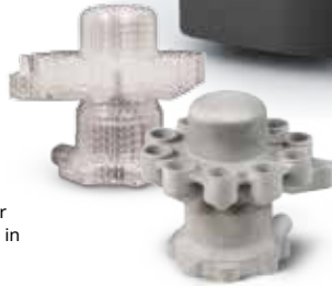
QuickCast® pattern in Visijet SL Clear, and aluminum casting