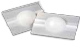
Microfluidic mixers printed in Visijet SL Flex