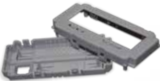
Electronic housing prototype printed in Accura Xtreme