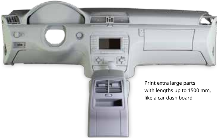
Print extra large parts with lengths up to 1500 mm, like a car dash board

3D Systems, the inventor of Stereolithography (SLA), brings you legendary precision in 3D printers, fine-tuned for cost-efficiency and unrivaled material availability. These advanced 3D printers produce exact plastic parts without the restrictions of CNC or injection molding. In addition to prototypes and end-use parts, these SLA printers create casting patterns, rapid tooling and fixtures. With speed, accuracy and surface quality of this level, you can produce low- to medium-run parts at a lower per-unit cost and build massive, highly-detailed pieces faster.