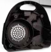
Back cover of vacuum cleaner printed in DuraForm EX Black