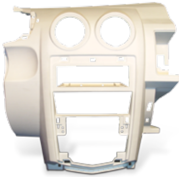
DuraForm PA Dashboard