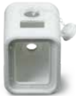
Housing for a laser sensor printed in DuraForm ProX PA