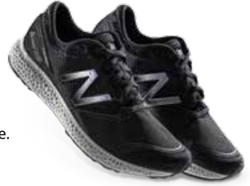
Production running shoe with midsole printed in DuraForm TPU Elastomer

* Availability varies by printer model (see details on the last page).