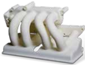
Manifold printed in DuraForm ProX PA

Lower your cost of ownership with automated production tools, remarkably high throughput, material efficiency and repeatability.