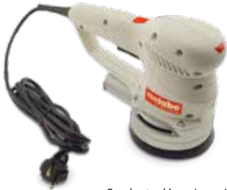
Sander tool housing printed in DuraForm PA material