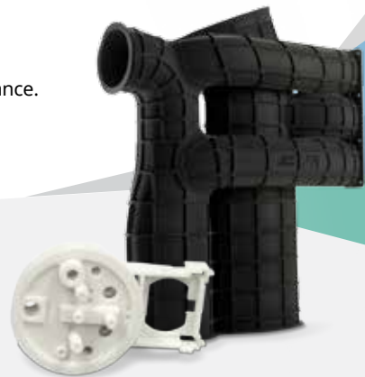
Electronic component printed in DuraForm ProX PA