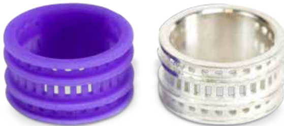
Ring printed in Visijet M2 CAST and cast