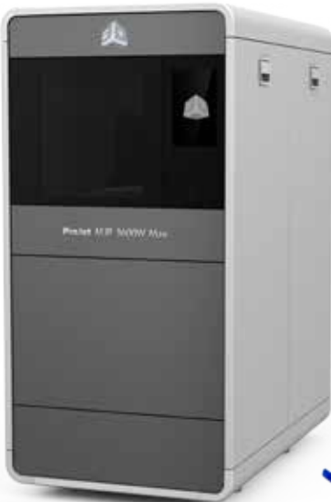
Projet MJP 3600W Series high-capacity, high throughput precision wax pattern 3D printer